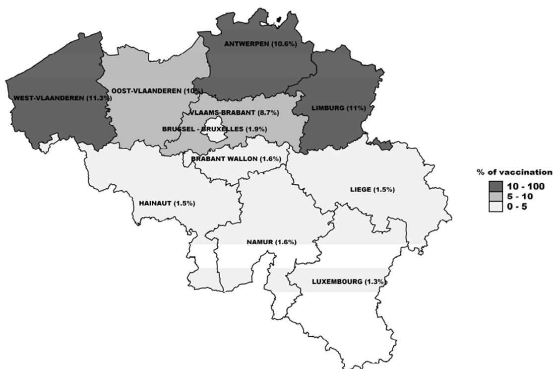
Figure 2. Cumulative percentage of vaccination recorded by Belgian provinces, situation on 31 March 2010